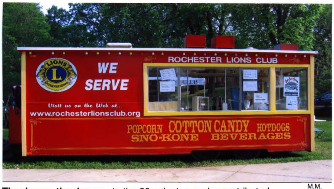
Thank you, thank you... to the 30 volunteers who contributed 175 hours and helped earn a net profit of $2,353.92.